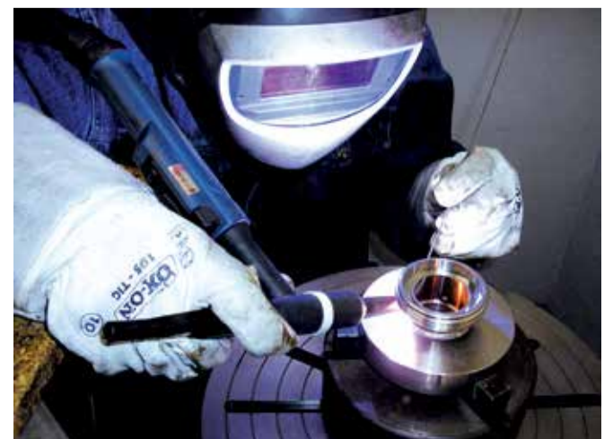
ATEC employees do their own welding