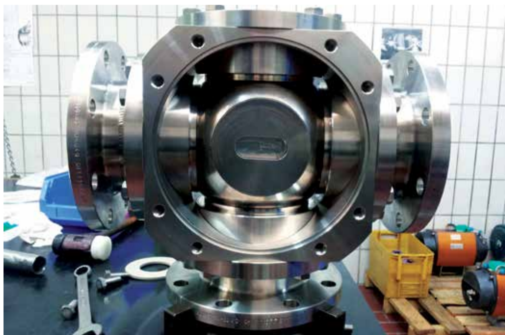
The three-way ball valve has a metal seal and no dead space

equipment skills continue to evolve, our goal shall always remain the same: Show flexibility and reliability with our dead space-free custom-made ball valves, and continue to act as problem-solvers in order to fulfill customer requirements.“