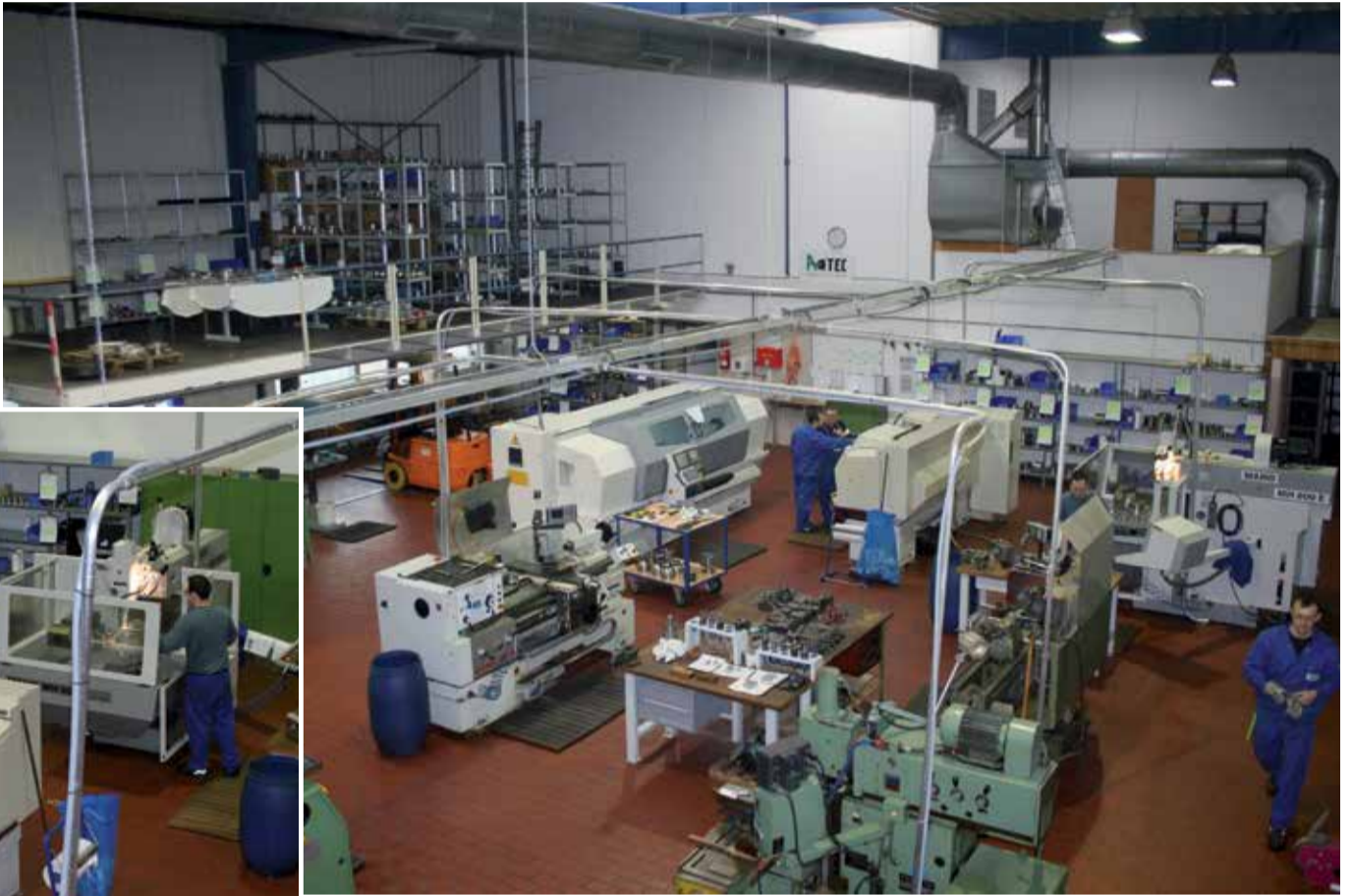
A view of the well-organized production hall and the modern technology that runs it

A guiding principle that requires no explanation. Adaptability is an integral component for success at ATEC Armaturenbau und -Technik GmbH. As a manufacturer of customized stainless steel and nickel alloy dead space-free ball valves, customer satisfaction is of the utmost importance. Hence, all its employees are aware of the importance of flexibility in their work. Each product is manufactured on-site and customized to the customer's individual needs. The high volume of orders and satisfied customers are proof of its success. However, the company is never content to simply rest on its past successes. It intends to arrive at more milestones by continually reinventing itself.