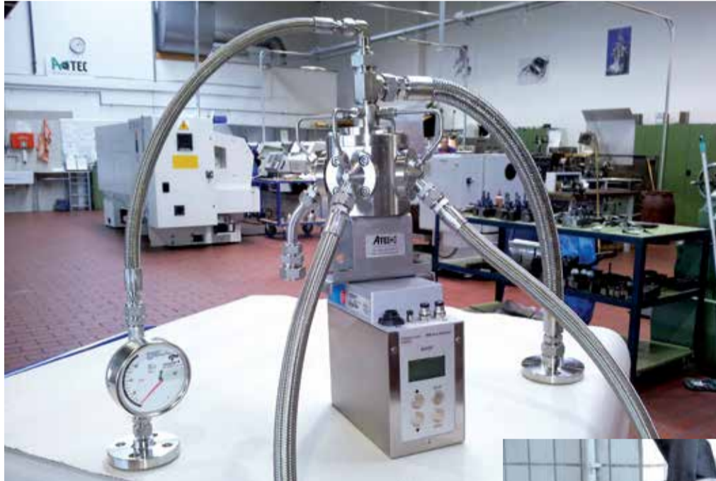
The five-way ball valve is ATEC's contribution to the environment