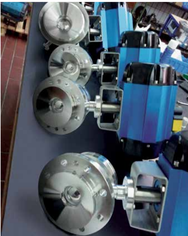
Bottom drainage ball valve for the pharmaceutical industry

A number of important milestones have contributed in no small way to the success ATEC Armaturenbau und -Technik GmbH enjoys today. The constant and complete inspections conducted before each product delivery which are accompanied by complete documentation and serial numbers for tracking has