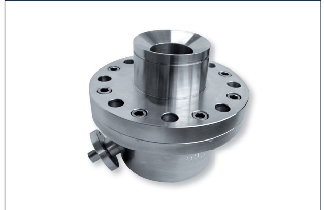
Bottom outlet ball-valve Ball valve inlet customized to special vessel pad flange