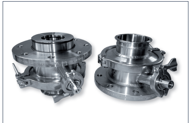
Bottom outlet ball-valve Quick opening device for easy valve disassembling