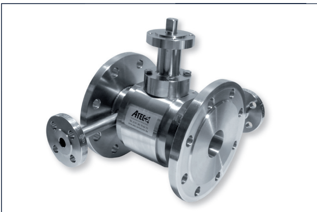
2-way ball-valve Heated body and flanges