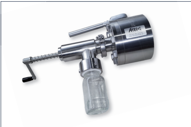
Sample ball-valve Clean sampling of solids with spiral conveyor