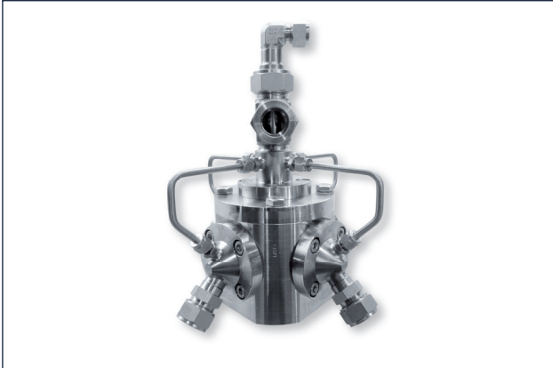
Multi way distributor ball-valve Applicable in waste incineration plant to reduce emissions